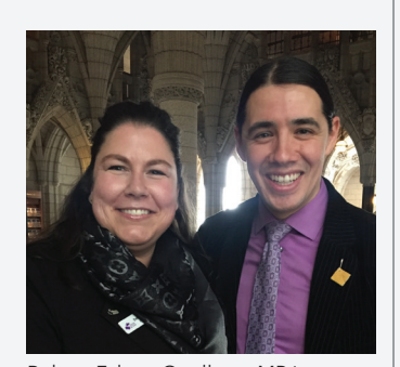
Robert-Falcon Ouellette, MP in Winnipeg Centre