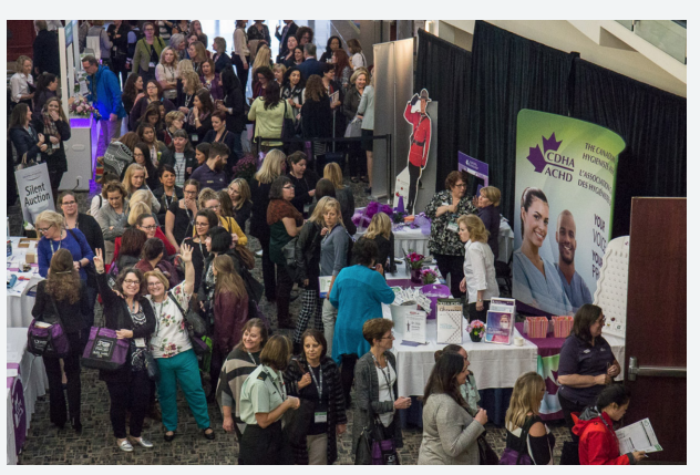
Main Hall, opening of the poster presentations