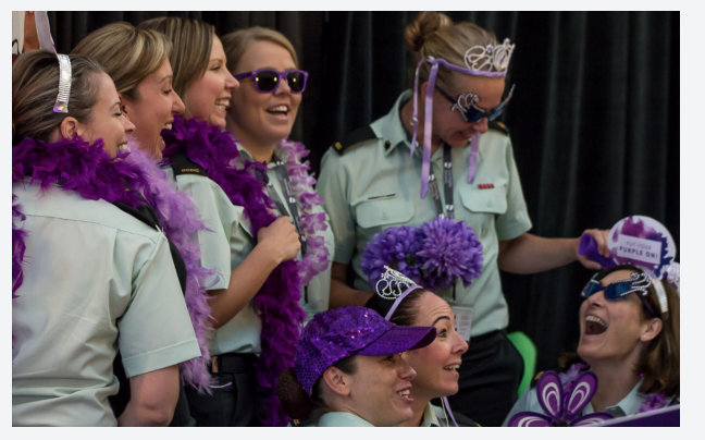
Members of the Royal Canadian Dental Corps