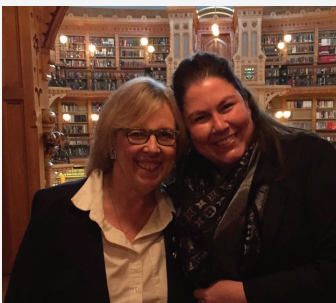
Ms. Elizabeth May, MP Saanich-Gulf Islands