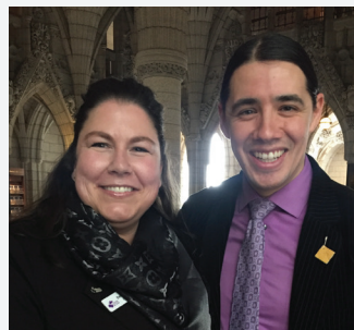
Robert-Falcon Ouellette, MP in Winnipeg Centre