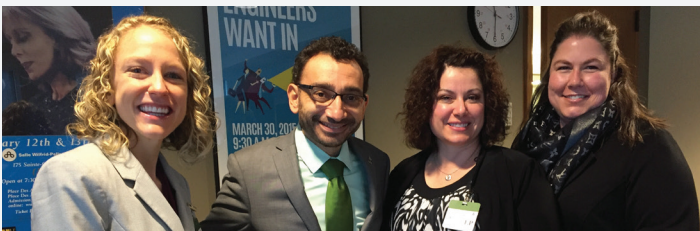
Omar Alghabra, MP Mississauga Centre