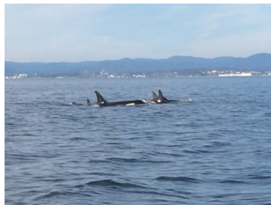
A pod of Orca whales swimming off the BC Coast

Oral health for older adults is a real concern, as there is a need for improved quality of life and increased access of care. Our collective explorative focus at the CDHA Provincial Presidential Meeting was on that of "Access to Oral Health Care for Older Adults" and parallel lobbying strategies. Candid discussions demonstrated that continuous dynamic intra-professional collaboration and teamwork, on interterritorial fronts, is fundamental and integral to the existence of quality client-centered health care. It is only together, through our combined knowledge, experience and expertise that we are able to best serve the oral health needs of our provincial communities, and national population.