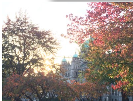
The British Columbia Parliament Buildings in Victoria, BC seen through the colourful autumn leaves.

In late October, members of the MDHA Board of Directors and Staff attended the Canadian Dental Hygienists Association National Conference, EXPLORE, and Annual General Meeting in beautiful Victoria, British Columbia. The