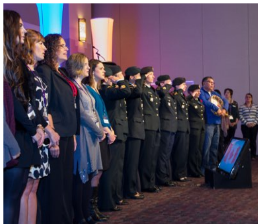
The Opening Ceremonies of the CDHA National Conference

EXPLORE-ation of this year's conference will forever be memorable: the West Coast culture, life and fresh seafood cuisine, the breathtaking sceneries and rich heritage, the observations of the natural habitat (baby orcas!), and the exploration of the highest quality oral health care education, research, and cutting-edge innovations.