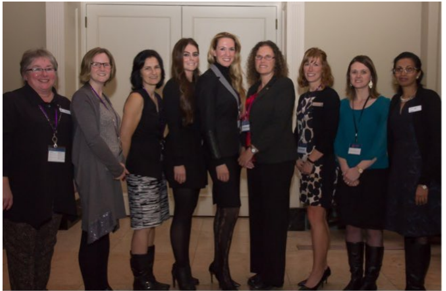
CDHA President and Provincial Presidents

The coming of the year 2016 will mark the 50 th Anniversary of the Manitoba Dental Hygienists Association! Since our incorporation in 1966, the MDHA has been fortunate to have a strong history, which defines us as the association, and ultimately as the profession, which we are today.