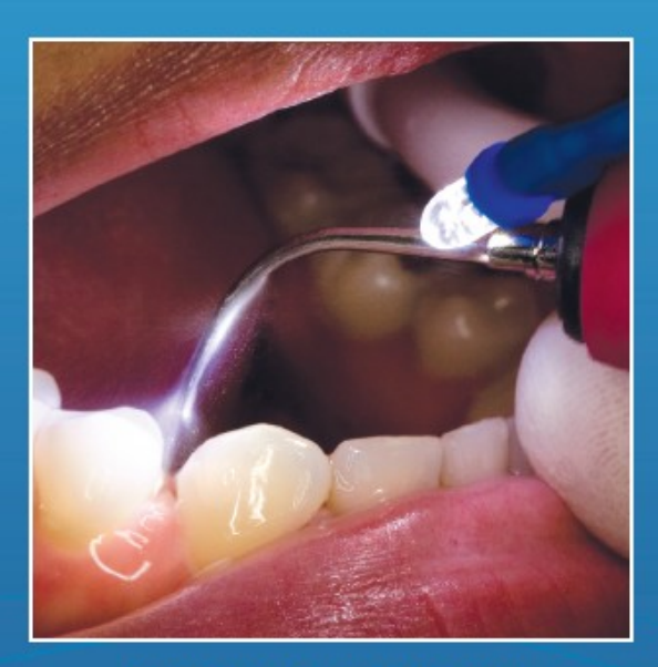
Brilliant Lightweight Light Source

For more information or to place an order, please contact an authorized DENTSPLY Distributor or your local DENTSPLY Territory Manager at 1.800.263.1437.