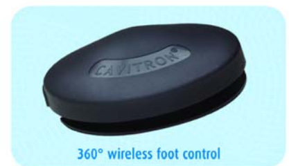
360° wireless foot control

To learn about all the innovative features of the new Cavitron® Plus™ and Jet Plus™, and what they can do for your practice, contact your authorized DENTSPLY Dealer or DENTSPLY Representative at 1-800-263-1437. Also, for more information, visit www.cavitron.dentsply.com