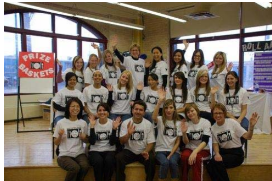
Siloam Mission-SUYS first shift

The 7th annual Soup Up Your Smile at the Siloam Mission showed to be yet another huge success. More than 500 Siloam Mission patrons benefited from the interactive displays, games, prizes & giveaways, and dental hygiene consultations, all organized by the Faculty of Dentistry's senior dental hygiene students in their efforts to promote oral health education and awareness while giving to those in need. Local businesses and individuals also showed great support in donating to the event.